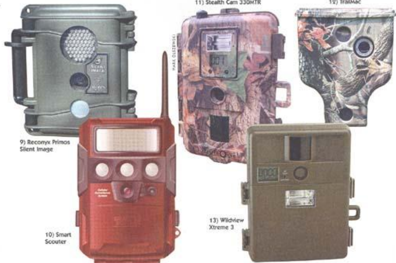
9) Reconyx Primos Silent Image

Gear Special Index: All product contact info on page 132